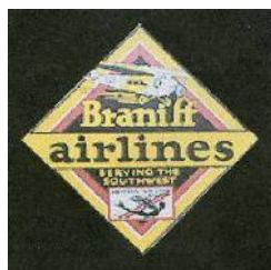
The original Braniff logo showed the Vega

The most junior trip on the airline was South Texas, aka “The South End”. From Love Field we served Fort Worth, Waco, Austin, San Antonio, Houston, Galveston, Corpus Christi and Brownsville. We were gone for six days, and never left Texas and never got back to Love Field. As an example, the trip left Love Field on Monday and returned to Love Field on Saturday. We had Sunday and maybe Monday off and then did it again. Wives were not thrilled by the arrangement. A union contract was worked out when we were paid the minimum for ‘time away from base’. Our working conditions improved. There are many memories of flying the “Gooney Bird”. It was a really fun time.