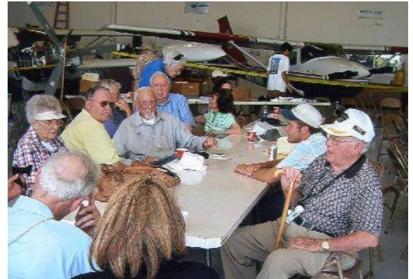
It was too hot to hold our business meeting in this hanger. So we moved to the air conditioned lounge.