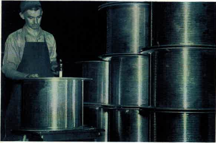
Each one of these cable drums meets most exacting specifications, as perfection is mandatory for smooth, easy operation.