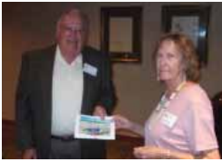
Door Prize

Pre-Reunion Advertising stated that the Door Prizes this year would be sensational and unique. Our members are so generous, and donate much to the success of a Reunion. Thanks to the Wings and other advertisers, and a special thanks to the members who donate books, DVDs or CDs for Door Prizes. Please give back and buy books and other materials from them.