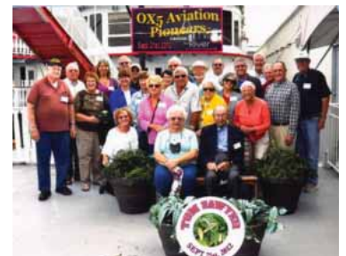
Cruise Photo purchased from River Cruise