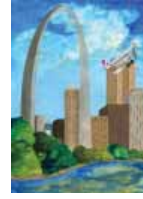
Art photos by Sylvia Cook