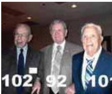
It is a blessing to have such wonderful members