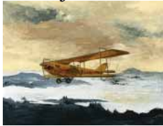
CD from CBW