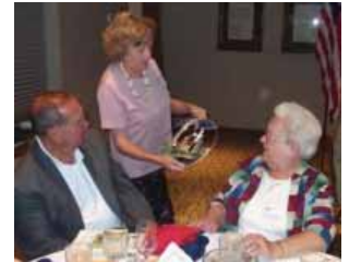
Original Stained Glass of St. Louis