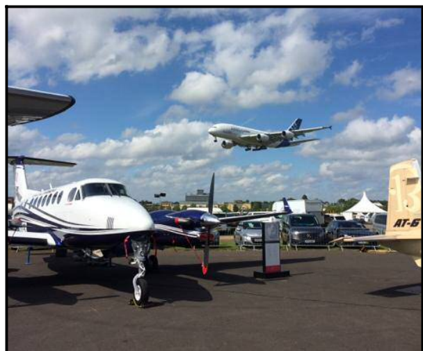
Air Bus A380 landing at Farnborough, England airshow July 12, 2016