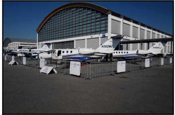
Friedrichshafen, Germany April 20-23